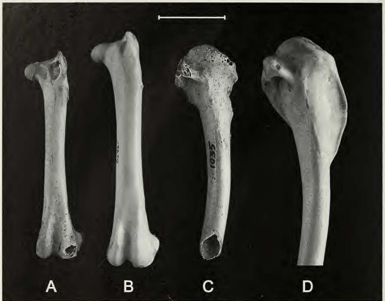
Fig. 2. Left femora (A, B) and right humeri (C, D) of Caracara : A, C. creightoni WS 1933; B, C. cheriway USNM 19670; C, C. creightoni WS 1035; D, C. cheriway USNM 19670. Scale = 2 cm.

creightoni from Las Breas de San Felipe indicate points of distinction not previously mentioned by Suárez and Olson (2001): the trochlea for digit 2 is reduced and not rotated posteriad, as opposed to being larger